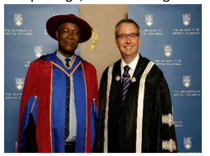
Figure 4 Prof. Eni and VC University of British Columbia

It is not so much about what one has accomplished, the titles held or conferred, the measure of wealth and prestige, and how long a life has endured that are of critical value but also about the quality of life